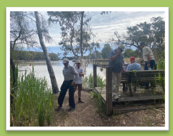
Down at the lock and weir, Murray River.